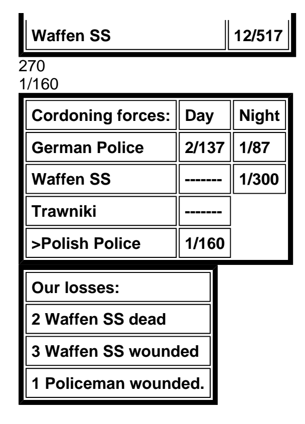
The 2 Waffen SS men lost their lives in the air attack against the Ghetto.

33 dug-outs were discovered and destroyed. Booty: 6 pistols, 2 hand grenades, and some explosive charges.